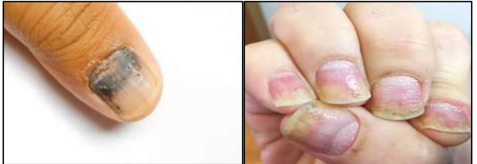
Fig xi. Hematoma Fig xii. Nail Psoriasis

x. Koilonychia: This condition is typically brought on by iron deficient anaemia. These nails are slender, concave, and have elevated ridges<sup>[18]</sup>.