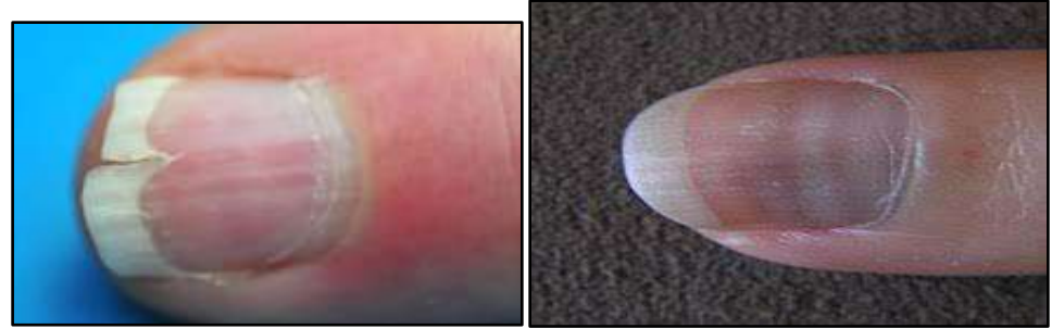
Fig vii. Onychorrhexis Fig viii. Leuconychia

viii. Leuconychia: This condition is brought on by trauma in which air bubbles become trapped in the layers of the nail plate, leaving a white line or spot on the nail. It may run in families, and there is no need for treatment because the spots will fade as the nail plate does<sup>[16]</sup>.