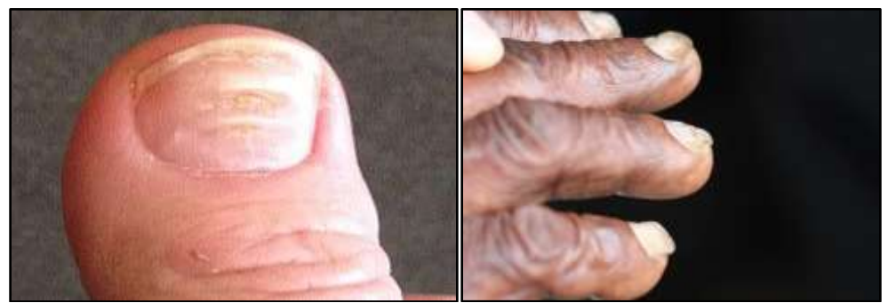
Fig ix. Beau's Lines Fig x. Koilonychia

and may be brought on by trauma, illness, starvation, any serious metabolic disorder, chemotherapy, or other destructive events <sup>[17]</sup>.