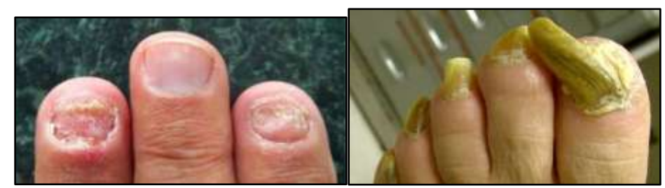
Fig v.Onychatrophia Fig vi. Onychogryposis

vi. Onychogryposis:It is a condition that causes claw-like nails and is characterised by a thickening of the nail plate<sup>[14]</sup>. This kind of nail plate curves inward, squeezing the nail bed and occasionally requiring surgery to provide pain relief.