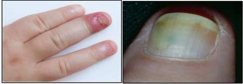
Fig i. Paronychia Fig ii. Pseudomonas bacterial infection

i.Paronychia: A nail fold infection brought on by bacteria, fungus, and occasionally viruses. A barrier or seal is created between the nail plate and the surrounding tissue by the proximal and lateral nail folds. This seal is easily breached, allowing the bacterium to enter. The discomfort, redness, and swelling of the nail folds are telltale signs of this type of infection. People who have their hands in water for an extended period of time may develop this illness, which is quite contagious<sup>[9]</sup>.