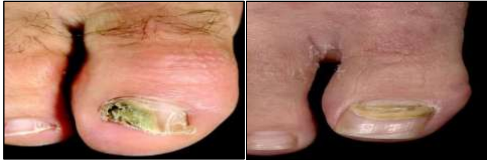
Fig iii. Fungal nail infection

iii. Fungal or yeast infection: A tear in the proximal and lateral nail folds, as well as the eponychium, can allow a fungal or yeast infection to invade and cause onychomycosis. Onycholysis, or the detachment of the nail plate, and visible debris under the nail plate are characteristics of this type of infection. It typically has a white or yellowish hue and might alter the nail's texture and shape. The protein keratin, which makes up the nail plate, is broken down by the fungus. Organic waste builds up under the nail plate as the infection worsens, frequently discolouring it<sup>[11]</sup>.